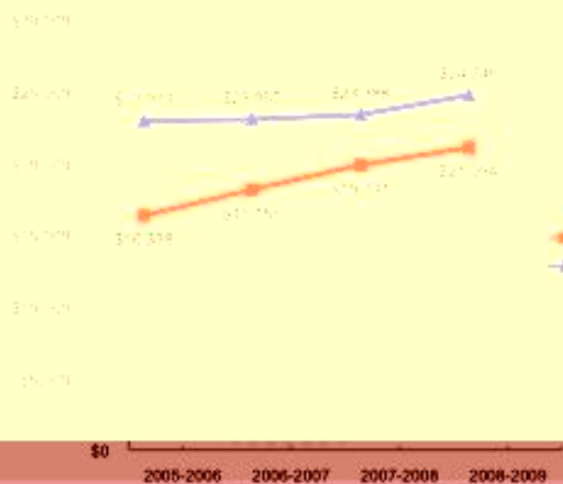
McGill vs G13 (excl McGill) Average Funding

2005-2009 McGill average fund increased 29%.